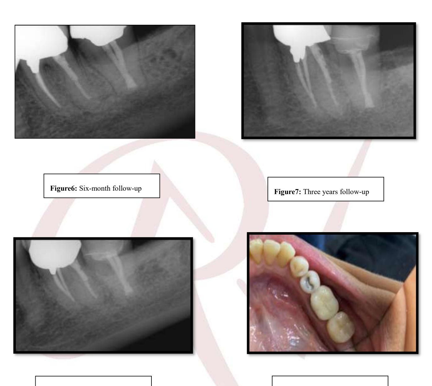
Figure8: Four years follow-up