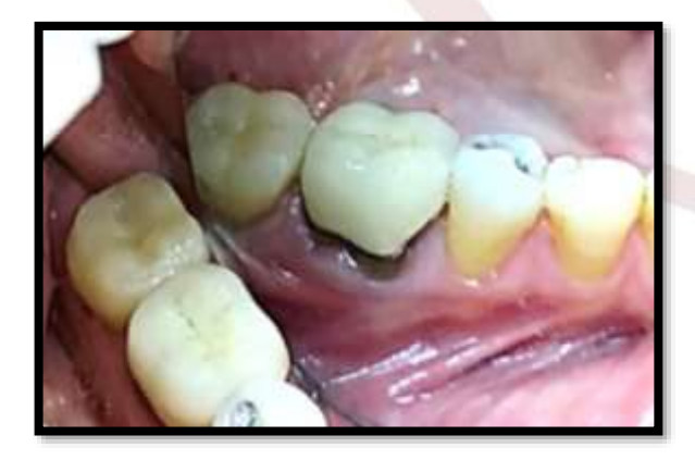
Figure8: Four years follow-up